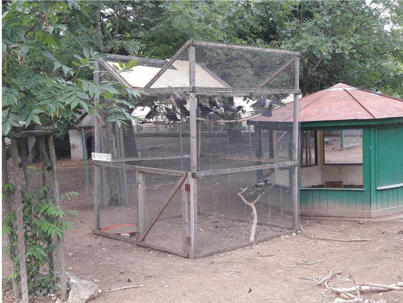
Figure 1. Ladder trap with some crows