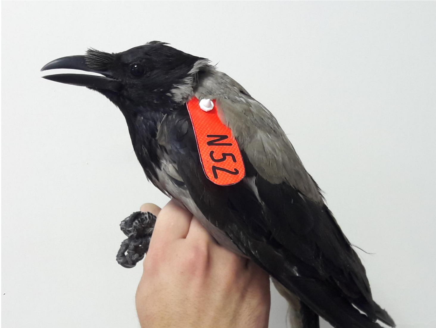
Figure 4. A patagial-tagged crow (North, 10km, second)